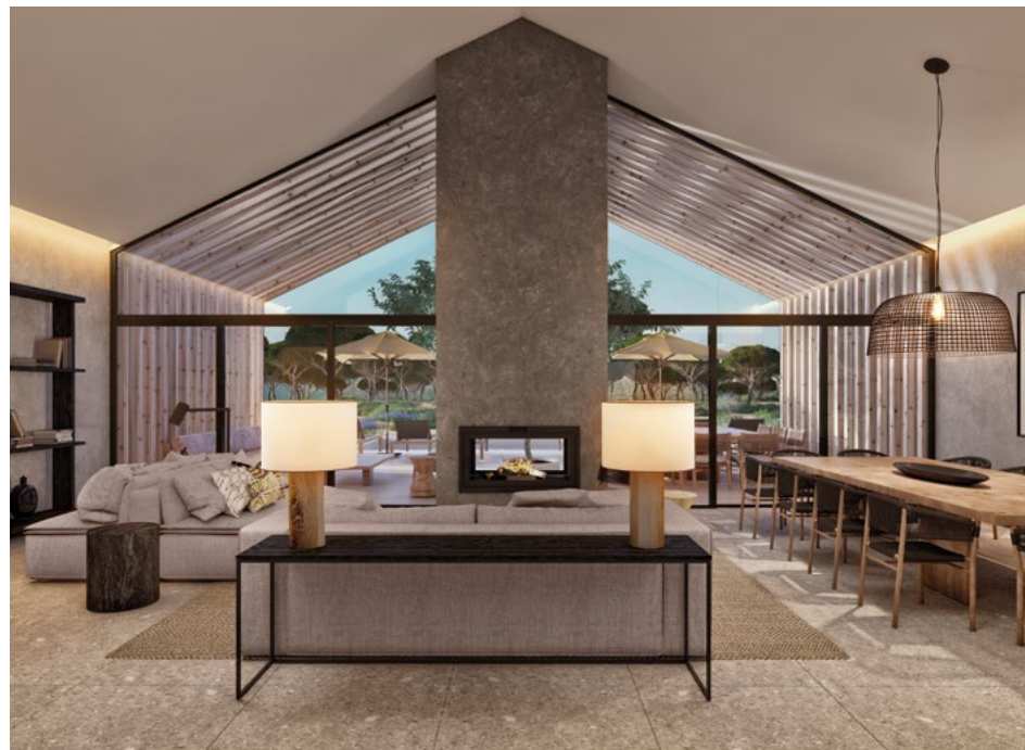
The floor to ceiling windows ensure a constant connection with the stunning surrounding nature.