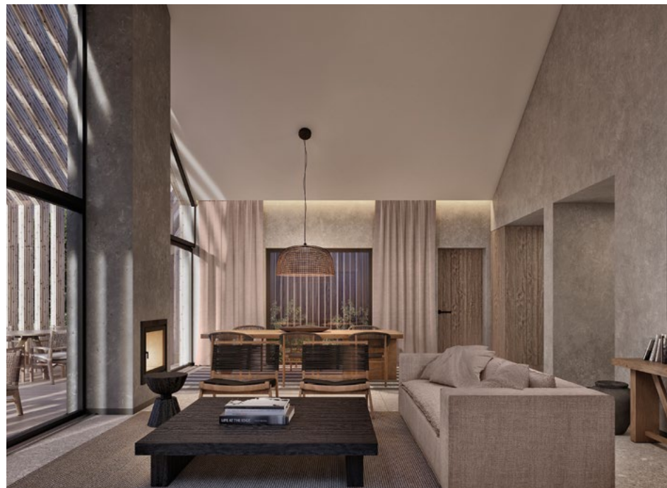
Fully furnished with luxurious finishings that fulfill the most demanding requirements.